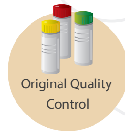
Original Quality Control

After more than 10 years of research and development on reagents, Mindray can now provide 48 parameters of dedicated reagents (more than 17 others are coming), covering hepatic, renal, cardiac, lipids, diabetes, pancreatitis, inorganic ions and immunoassays, etc., together with original calibrators with metrological traceability as well as controls for BS-130 chemistry analyzer.