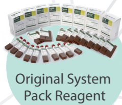
Original System Pack Reagent