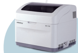
Auto Chemistry Analyzer