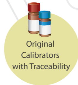
Original Calibrators with Traceability